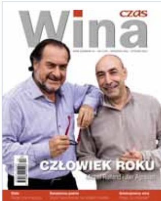
Czas Wina 54