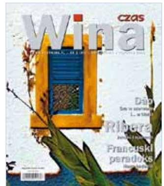
Czas Wina 47