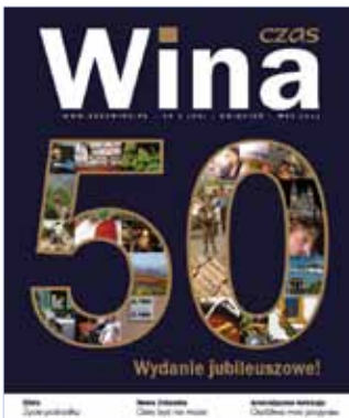
Czas Wina 50