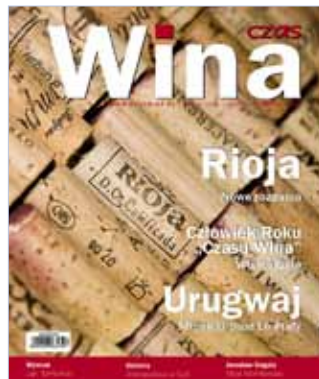
Czas Wina 49