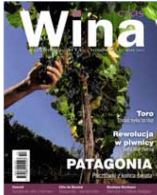
Czas Wina 53