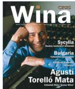
Czas Wina 48