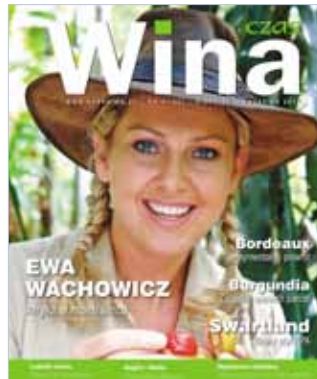
Czas Wina 52