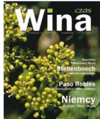
Czas Wina 45