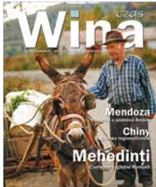
Czas Wina 46