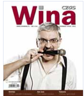
Czas Wina 51