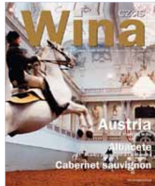
Czas Wina 44